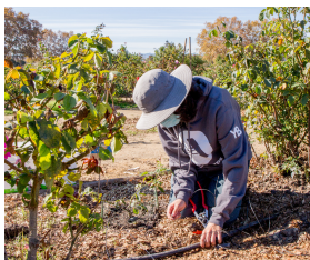
HERITAGE ROSE GARDEN

Trail and Park beautification clean ups, landscape maintenance, tree care, and much more!