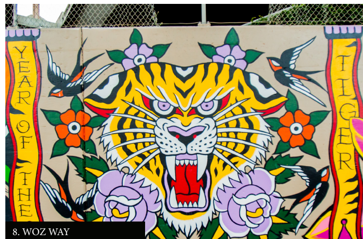
8. WOZ WAY