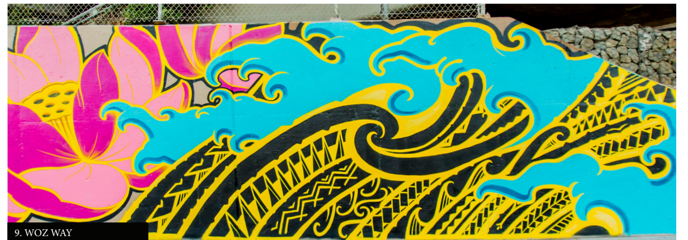
9. WOZ WAY