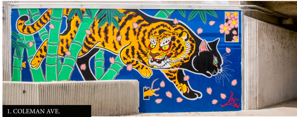
1. COLEMAN AVE.