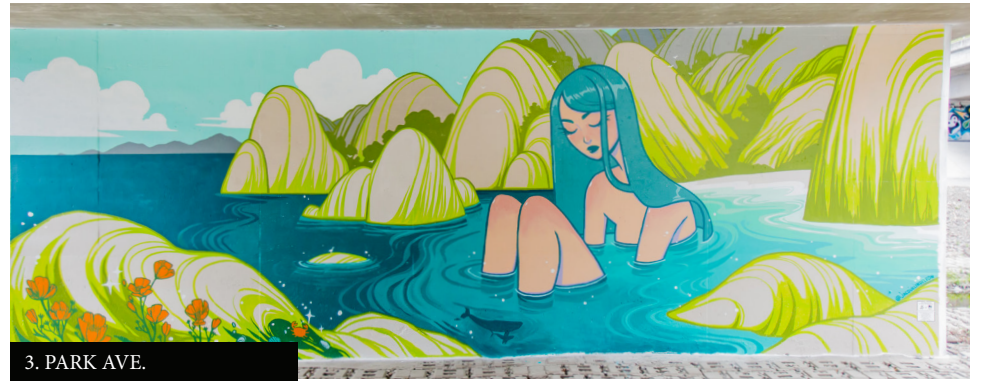
3. PARK AVE.