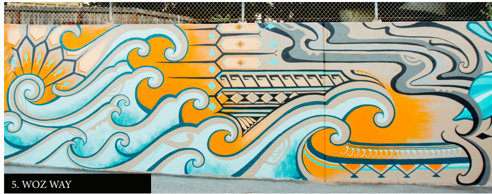
5. WOZ WAY