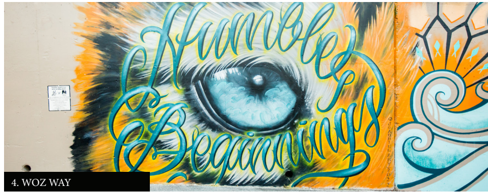
4. WOZ WAY