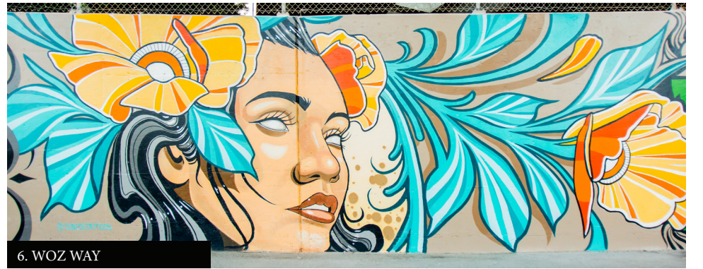
6. WOZ WAY