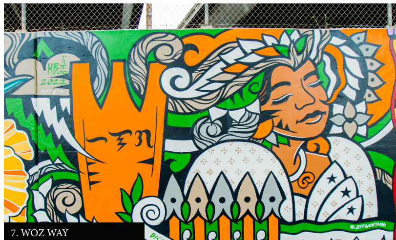
7. WOZ WAY